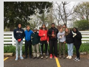
Photo: Oberlin College track team grounds volunteers, 2023.